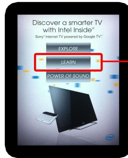
Touch screen image 1

NOTE: There is only audio heard through the HT-SS380 Home Theatre Speaker System when selecting LEARN , then one of the three options that you are presented with on the touch screen; Complete and Powerful Search , Personalize or Search Made Simple . The looping video, the EXPLORE , and POWER OF SOUND options have no audio.