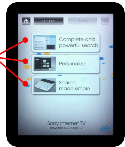
Touch screen image 2